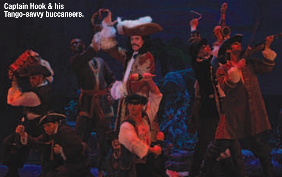
Captain Hook & his Tango-savvy buccaneers.

Few shows give artisans of the stage such a playground to let loose—and this troupe in Branson has definitely seized every opportunity to work their magic. The magic begins the moment the curtain suddenly becomes dreamlike as it transports us into old Victorian England. From there we will fly high in the clouds on a shower of fairy dust, we will find ourselves in a Never-Never-Land of swashbuckling pirates, a wild tribe of lost boys, a band of colorful, high-energy natives led by an Indian princess—and oh